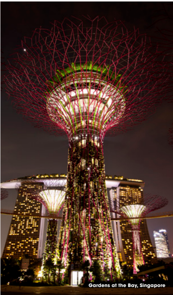
Gardens at the Bay, Singapore

Please contact us for full details. Numbers are limited so please book this simultaneously with your ship reservation.