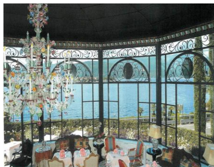
Hotel Regina Palace at Stresa on Lake Maggiore

Hotel La Pergola: is a charming, small, family-run 3 star hotel on the shore of Lake Como with its own jetty in the tiny fishing harbour of Pescallo: rooms have lake views. Our private boat will operate from here and Bellagio village is a 10 minute walk along a pretty pathway between the private villas. 3 nights.