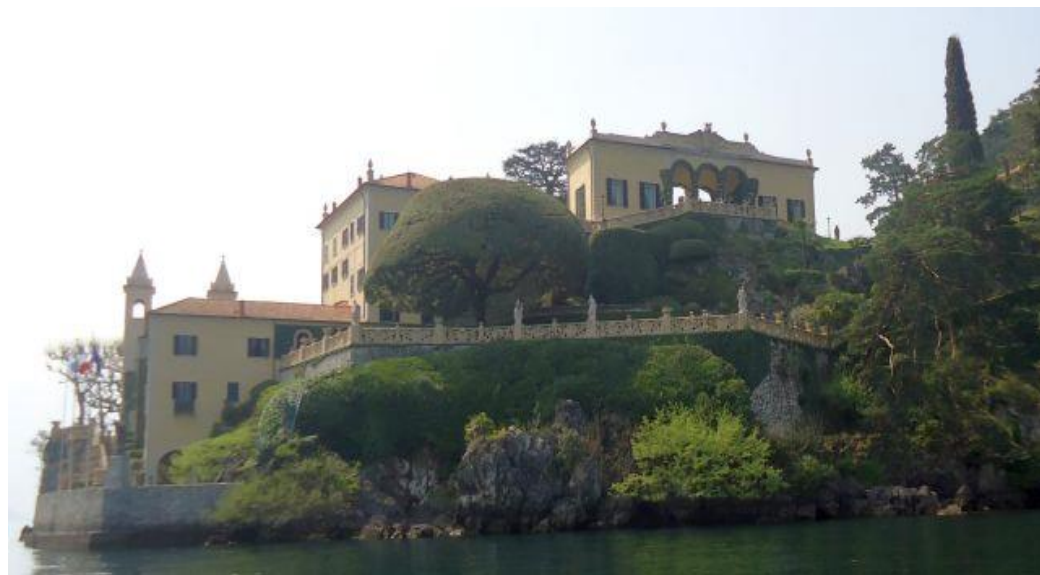
Villa Balbianello from Lake Como