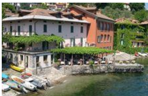
Hotel La Pergola, Pescallo

Hotel La Pergola: is a charming, small, family-run 3 star hotel on the shore of Lake Como with its own jetty in the tiny fishing harbour of Pescallo: rooms have lake views. Our private boat will operate from here and Bellagio village is a 10 minute walk along a pretty pathway between the private villas. 3 nights.