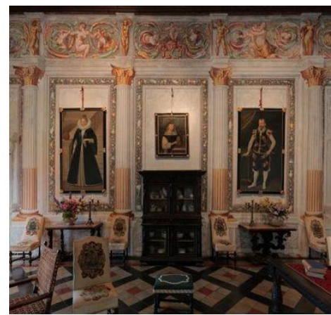
Villa Cicogna Mozzoni