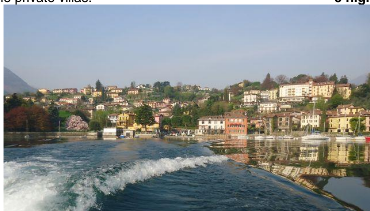
Departing across Como from our hotel at Pescallo

COSTS for 6 day tour Deposit Sterling £250.00 Balance Eur 2,170 (equivalent to £1,783 @ May 2014)