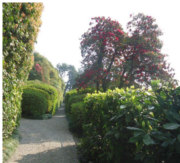
Villa Carlotta & Terraces