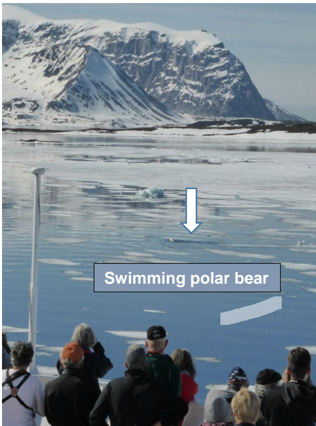
Swimming polar bear